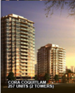
CORA COQUITLAM 257 UNITS (2 TOWERS)