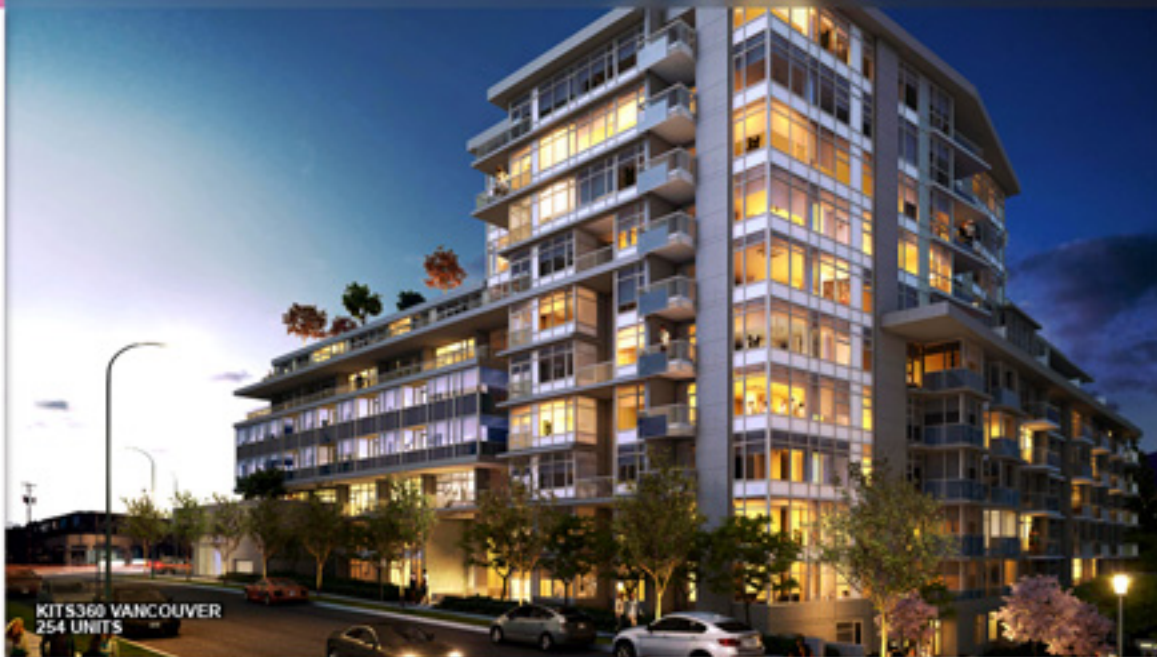
KITS360 VANCOUVER 254 UNITS