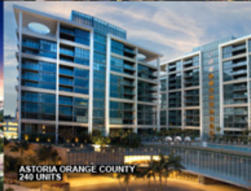
ASTORIA ORANGE COUNTY 240 UNITS