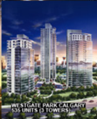
WESTGATE PARK CALGARY 536 UNITS (3 TOWERS)