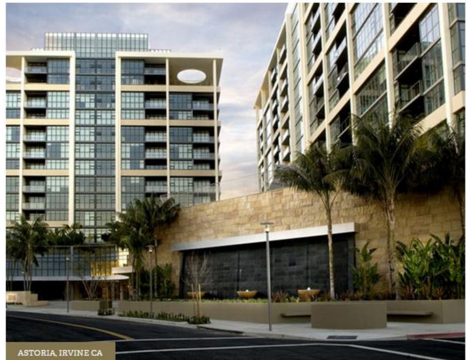
ASTORIA, IRVINE CA

EXPERIENCE HAS SHOWN US THAT IT'S EASIER TO MAINTAIN HIGHER QUALITY STANDARDS WHEN YOU DO THE WORK YOURSELF.