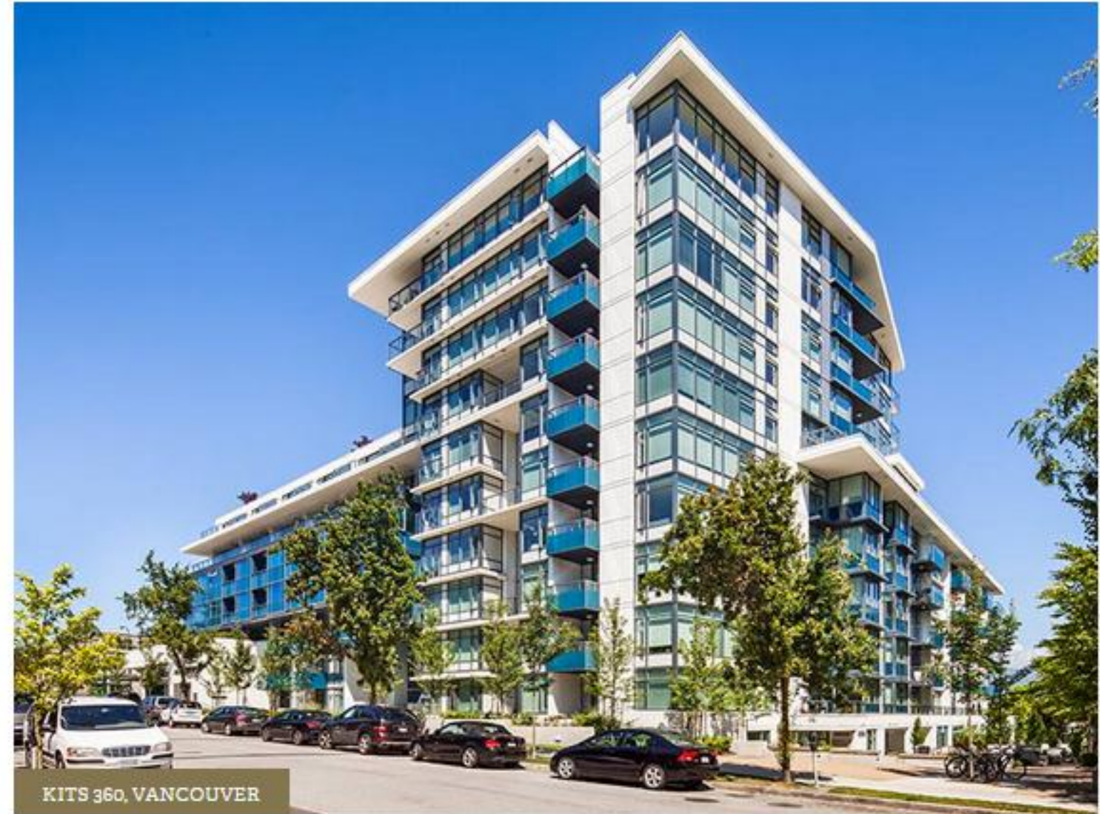
KITS 360, VANCOUVER