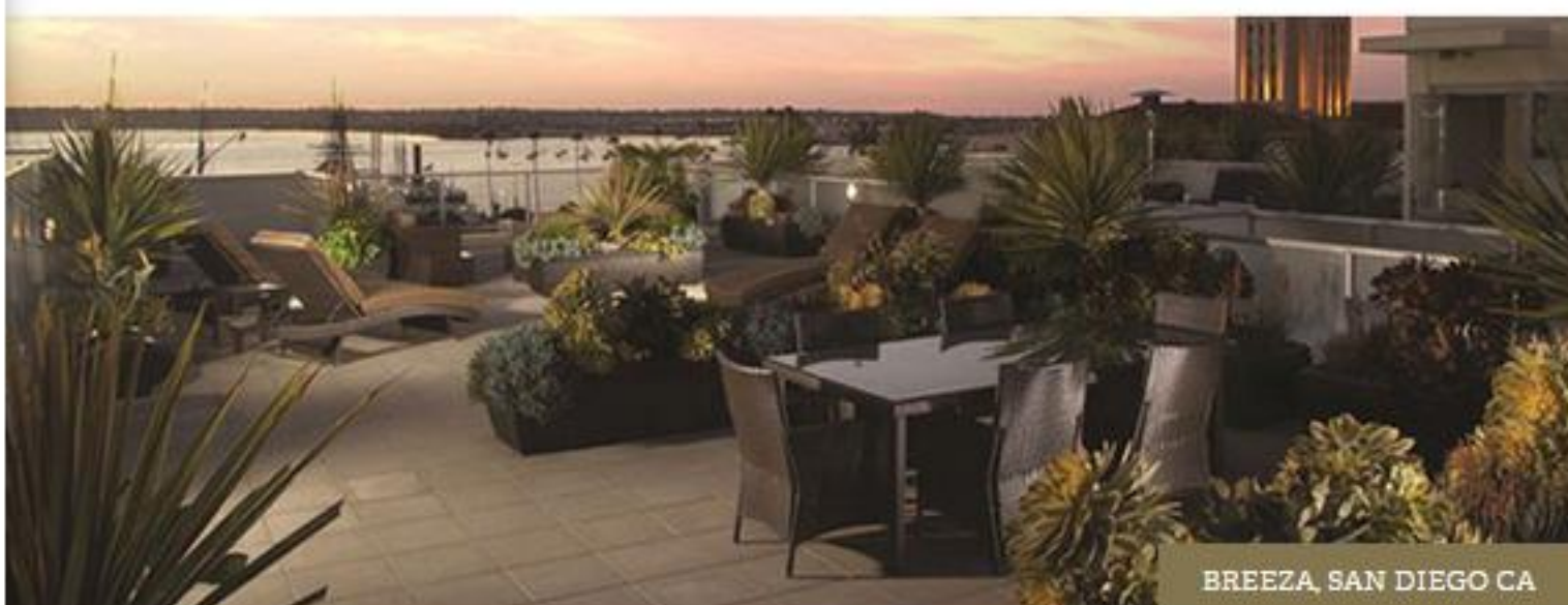
BREEZA, SAN DIEGO CA