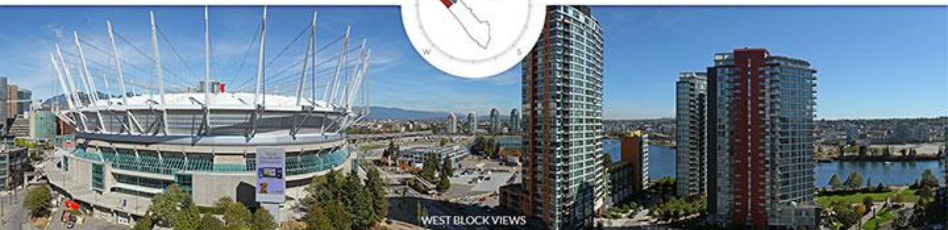
WEST BLOCK VIEWS