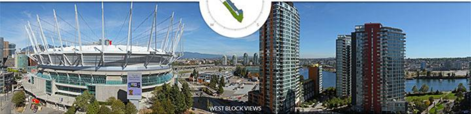
WEST BLOCK VIEWS