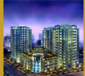
OCEAN WALK, RICHMOND