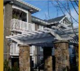
HERON COVE, TSAWWASSEN