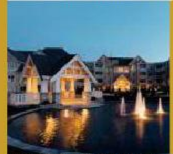
ZENIA GARDENS, RICHMOND