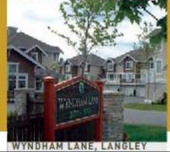
WYNDHAM LANE, LANGLEY