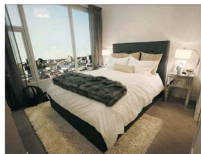
Bedrooms in The Residences at West will make efficient use of space.