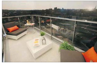
Large outlooks will be an offer at the project, as demonstrated by the deck in the show suite.

After a sales launch in June, The Residences at WEST have just over 70 per cent sold. This stage will bring in the first 20,000 square feet of retail, while the second phase will bring in the remaining 23,000 square feet of shopping and commercial space. Architects Walter Franci's design allows tower residents to see the waters of False Creek and the building's tower portion has been designed to take full advantage of the view corridors that remain in between the