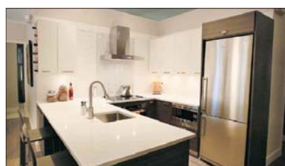
The display suite interiors include a roomy kitchen that maximizes counter space with a fan over the stove, centre island and stainless steel appliances.