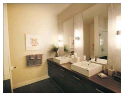
The bathrooms are intended to convey the luxury and comfort of a hotel.