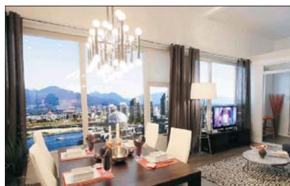
The display suite at The Residences at WEST has a flexible floor plan and large windows. The project's first phase comprises 189 homes

The family bought a one-bedroom unit in the