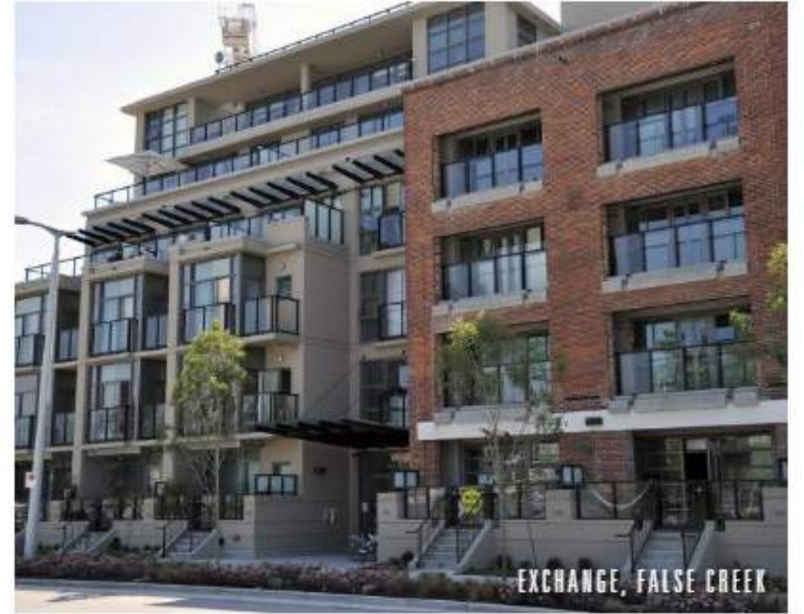
EXCHANGE, FALSE CREEK