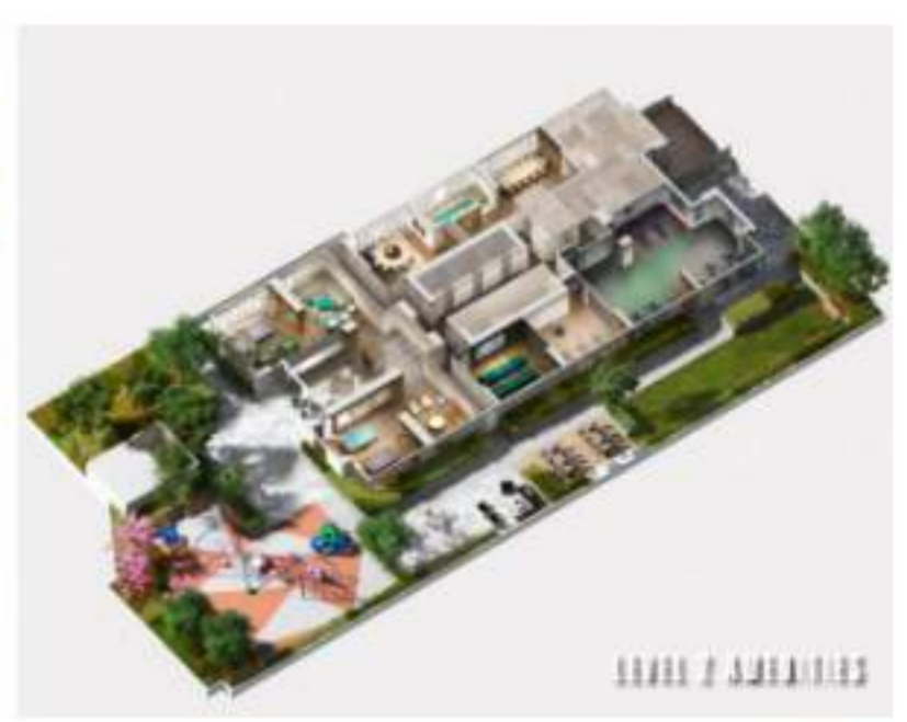
SCENE 2 - AMENITIES