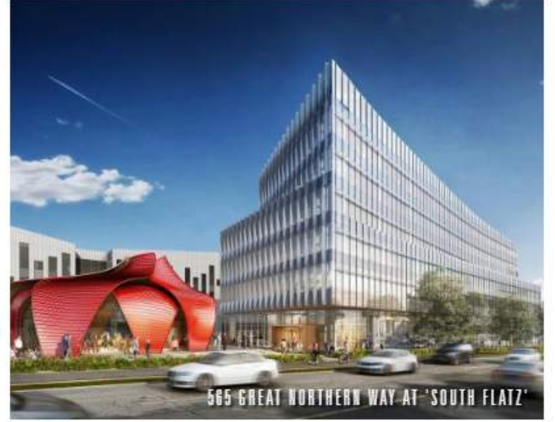
565 GREAT NORTHERN WAY AT 'SOUTH FLATZ'