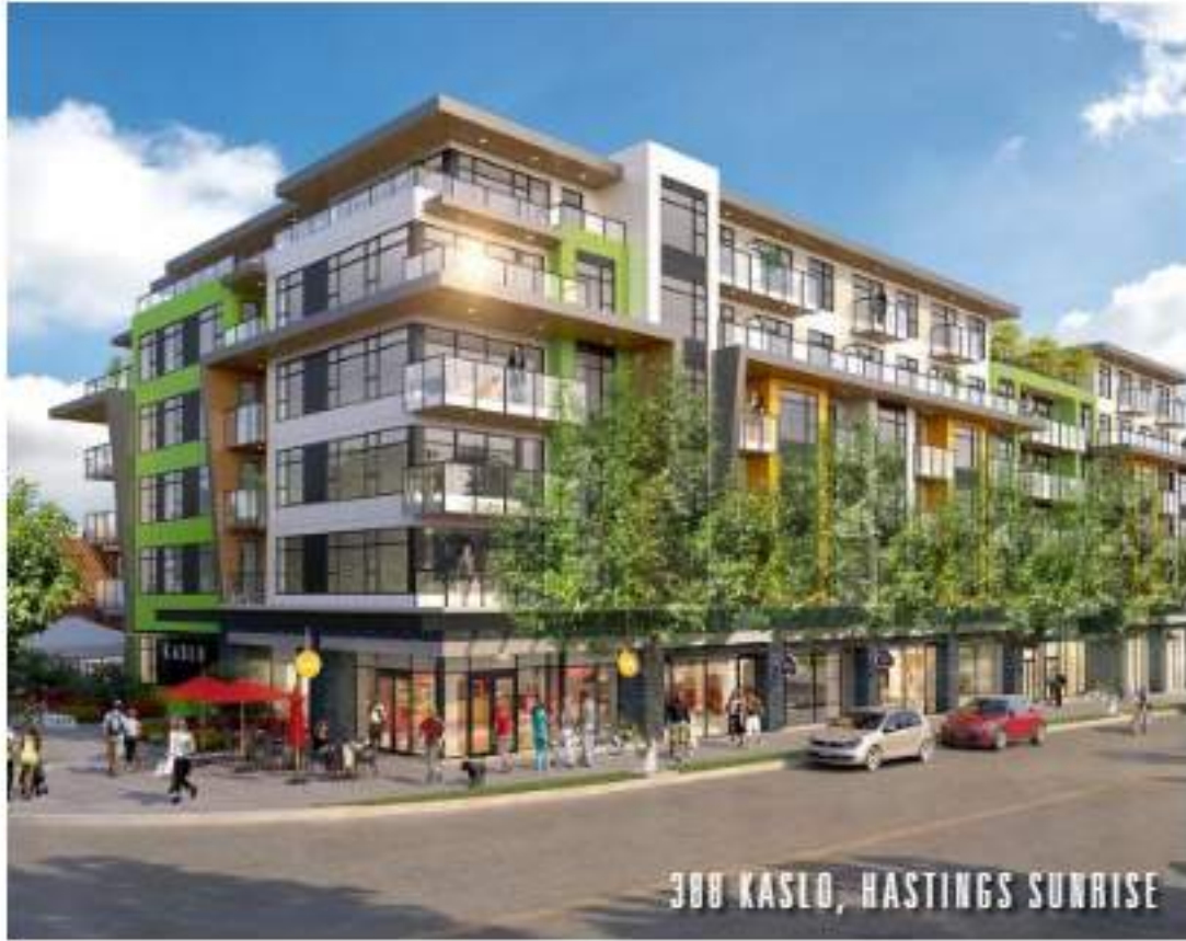
300 KASLO, HASTINGS SUNRISE