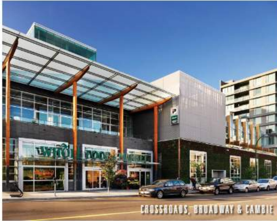
CROSSROADS, BROADWAY & CAMBIE