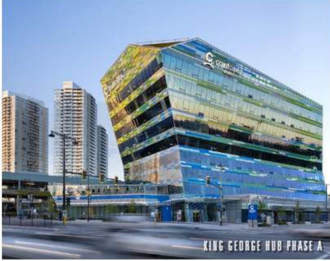
KING GEORGE HUB PHASE A

PCI Developments is a privately owned Vancouver-based developer. Known as the visionary force behind iconic local projects including Marine Gateway and Crossroads at Cambie, PCI is guided by core values of integrity, discipline, vision and innovation. Over the past 35 years, PCI has created more than 6 million square feet of real estate, helping to establish some of Metro Vancouver's most prominent urban landmarks. They are committed to creating sustainable and successful mixed-use urban communities that provide exceptional places to live, work and play. Their homes are defined by engaging contemporary architecture and design, highly functional spaces and outstanding amenities.