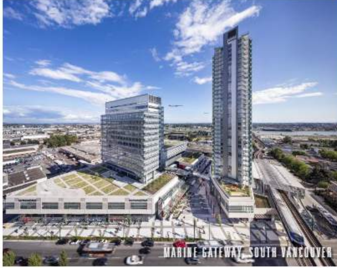
MARINE GATEWAY, SOUTH VANCOUVER